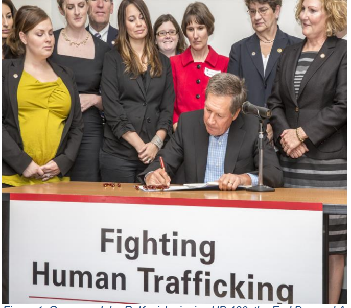
Figure 1: Governor John R. Kasich signing HB 130, the End Demand Act, into law on June 20, 2014.

The Polaris Project, a non-profit anti-human trafficking organization, recognized Ohio as one of the Most Improved states in 2012, in terms of anti-human trafficking laws. The Safe Harbor Law (HB 262) went into action in 2012, and the End Demand Act (HB 130) was enacted in 2014. As a result of these laws, juvenile courts in Ohio are working to prevent and protect children who have been, or might become, victims of human trafficking. Also, due to the Governor's Task Force, a screening tool was developed to identify potential victims (http://mha.ohio.gov/Portals/0/assets/Initiatives/HumanTraficki ng/2013-human-traffricking-screening-tool.pdf). The Task Force's 2015-2016 goals are to: 1) strengthen law enforcement and justice system knowledge of state and federal trafficking laws, 2) collect and disseminate reliable data, 3) identify solutions to timely recovery and shelter services, 4) identify evidence-based prevention strategies for youth, 5) support and build capacity of local partners to respond to trafficking, 6) monitor progress on the use of the screening tool, 7) create a Task Force Speakers Bureau to deliver human trafficking presentations, 8) increase public awareness, and 9) train local workers. Task Force Report, 2015